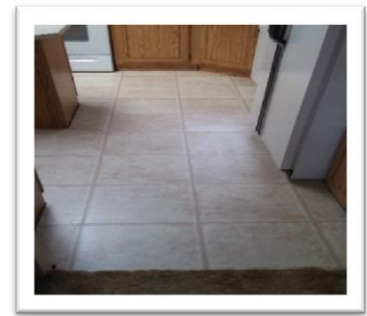
Linoleum replacement for wheelchair-bound homeowner

Thank you to our Critical Home Repair program sponsors and supporters, present and past: The Eugene and Marlaina Johnston Foundation, Coquille Indian Tribe, Jordan Cove-Pacific Connector, Oregon Coast Community Action, Umpqua Bank, U.S. Bank