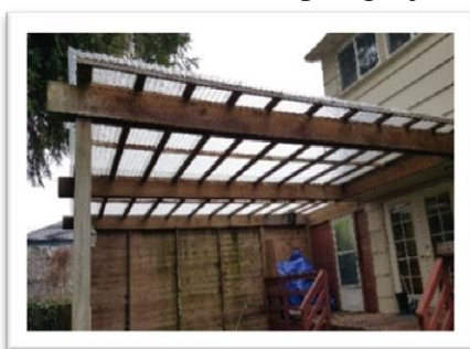
Roof panel replacement over children's play area